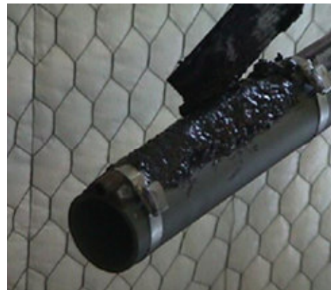
Typical hand trowel application

Note: Material Safety Data Sheet (MSDS) available.