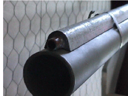
Optional HTM Channel reduces waste, weather protects and eliminates curing requirements